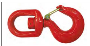
Safety: homologated self locking swivel hook